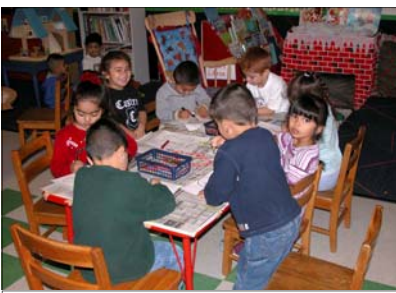
Good Shepherd kids hard at work

The Carl B. & Florence E. King Foundation recently awarded a grant in the amount of $20,000.00 to Good Shepherd Community Center. The funds are designated for program support for childcare and outreach services offered to low-income families in West Dallas.